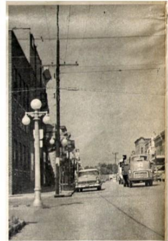
Did you know that the Library has thousands of historic pictures available? Can you name the decade this picture was taken?

When people think of the library, they typically think of books. But the library is so much more than books. Anyone can benefit from owning a library card.